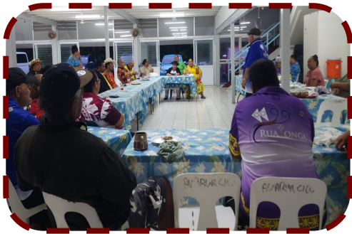
Ko te katoatoa o te tapere Rua-tonga e tetai pae no Avatiu tei tae ki teia angai'anga.