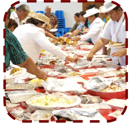
Tuanga no te kaikai, tei aka'teateamamao'ia e te Ekalesia Avarua e te RKE.