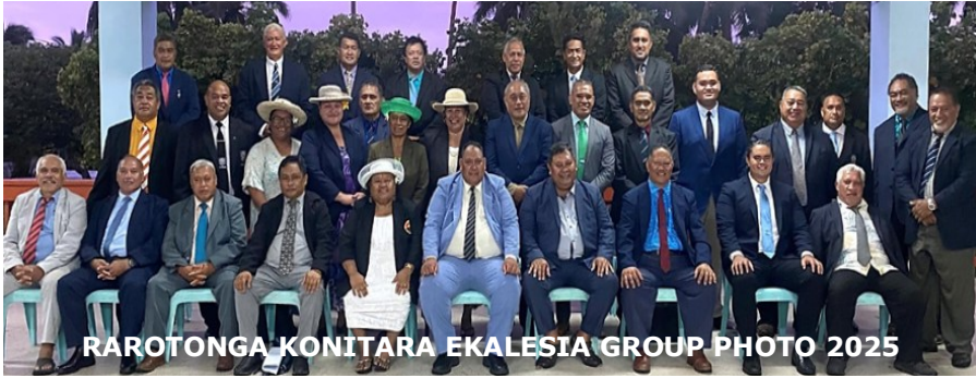
RAROTONGA KONITARA EKALEZIA GROUP PHOTO 2025

I te Paraparau ra 13 o Peperuare, mataiti 2025, kua akatuera'ia atu te uipa'anga mua a te Rarotonga Konitara Ekalesia (RKE) no teia mataiti. Kua raveia te reira ki roto i te are pure o Silo i Matavera; ko te ekalesia Matavera oki te akaaere o te konitara i teia mataiti.