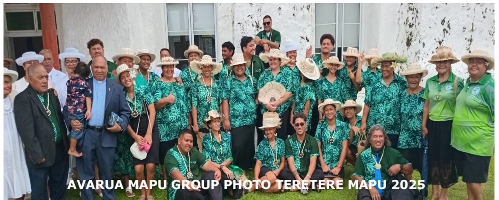
AVARUA MAPU GROUP PHOTO TERETERE MAPU 2025

I te Sabati ra 16 o Peperuare 2025, kua akatuera ia te angaanga mua a te putuputuanga mapu, koia ko te "Teretere Mapu", o Rarotonga nei.