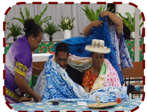
Oronga taonga rima na te Orometua e tana vaine.