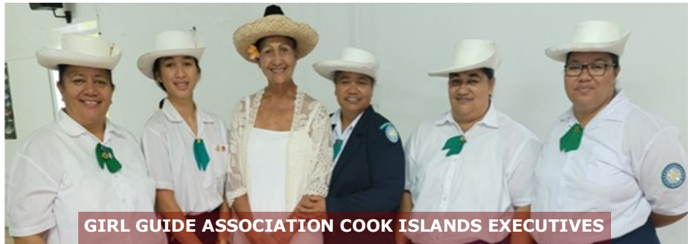
GIRL GUIDE ASSOCIATION COOK ISLANDS EXECUTIVES