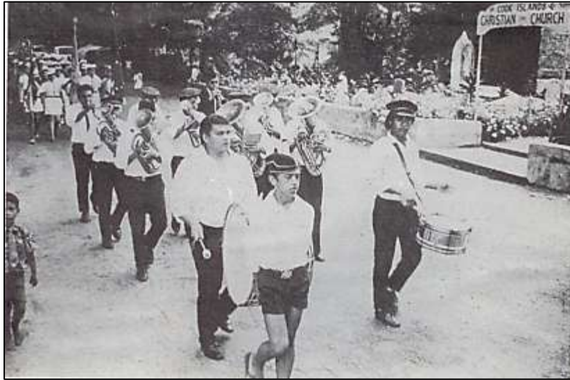
Combined church parade, Titikaveka, 1974.