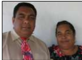
Tapaitau & Torohata Marsters Proposed Ekalesia: Tetautua, Penrhyn