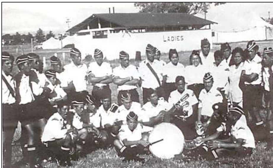
Cook Islands Boys' Brigade Stringband, Tomoana, Hastings, 1983/84.