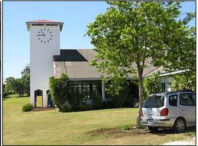
The same chapel from about the same angle, taken almost the same time 50 years later as per clock