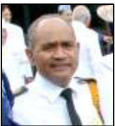
(Tataia e Taepae Tuteru)

Kia manuia i roto i te aroa maanaana o to tatou Atua.