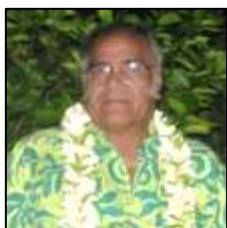
(Tataia e Tamaiti Vai Peua, Ekalesia Pukapuka & Nikao)

Kia akamanuia mai te Atua no tatou katoatoa pera katoa kia riro teia Uipaanga Maata ka raveia ki Aitutaki ei tuatau mataora e te manuia no te au tavini o te Atua e pera to ratou au mata.