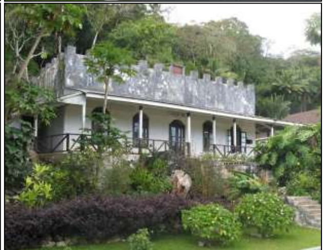
Lecture Hall, Takamoa Theological College, 1919.