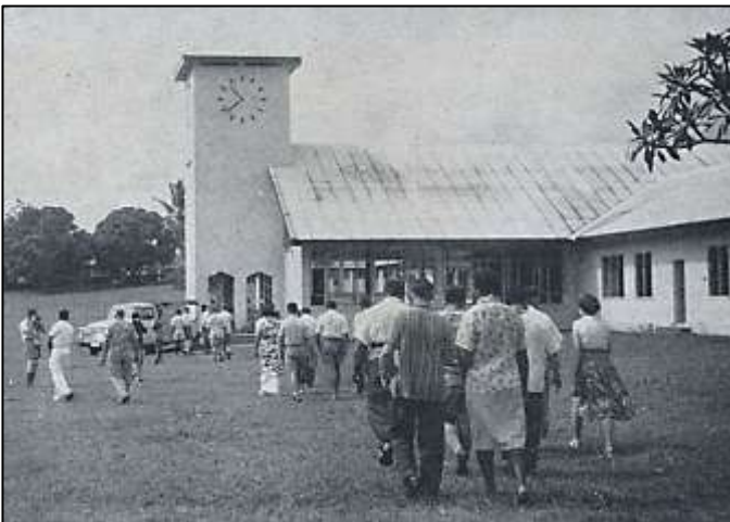
The chapel at Malua Theological College in 1961

Me akakouia ireira nga mea i runga nei, ka tuatua tatou e kua sumaringa te au mea katoatoa. Ko ta te Atua oki teia i rave na roto i tona au tavini i Samoa no tona au tavini mei vao mai, e kua akara matou ma te umere maata e te akameitaki i te Atua.