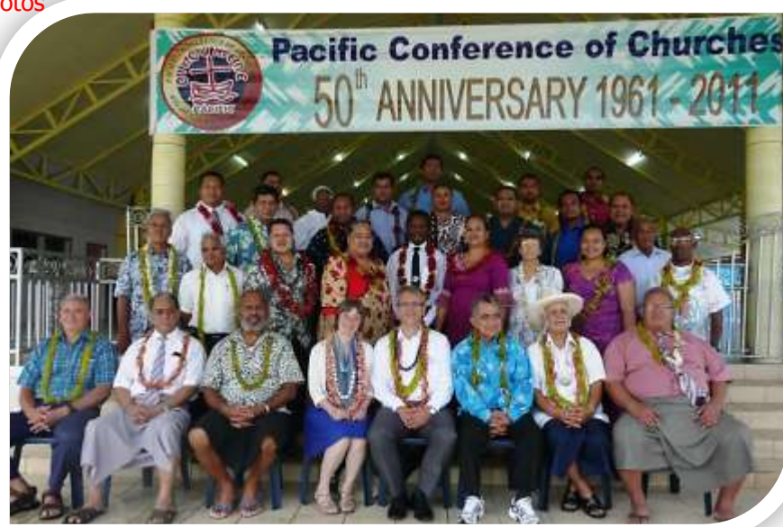
Samoa, Aug/Sep 2011: Pacific Church Leaders Meeting (PCLM) held at Piula Theological College, followed by the 50 th Anniversary Celebrations of the Pacific Conference of Churches (PCC) held at Malua Theological College.

After that, September 2013, Melbourne, Australia