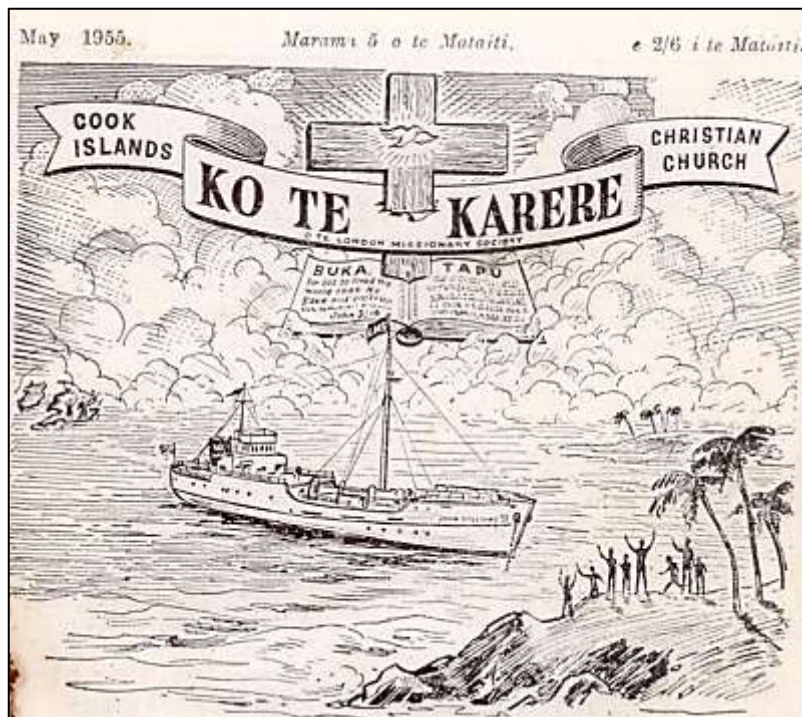
Cover page of the monthly "Karere" in the 1940s-50s. The name of the boat is "John Williams VI".

" KO TE KARERE " (Karere) is a regular publication of the Cook Islands Christian Church. Its format has changed a few times over the years. Up to the 1970s, the Karere was published monthly and comprised of 3 parts: (1) scripture readings and uapou questions for each Sunday of the month, (2) a section set aside specifically for Sunday School, and (3) news, notices and announcements for the benefit of the CICC's branches on Rarotonga and in the outer islands. There were no branches in New Zealand and Australia back in those days. Printing was done at Takamoia by the LMS Press.