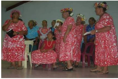
Tapere Akaea e tana imene tuki.