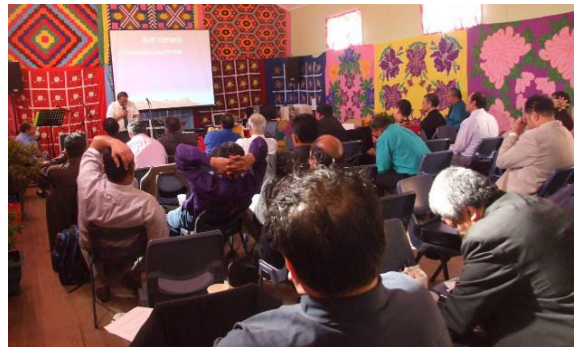
Workshop by the CICC Executive with the Australia CICC Council, September 2008, Melbourne