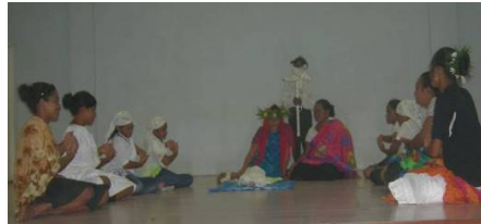
Te anau anga o Iesu (Mataio 1:18-25, 2:1-11)