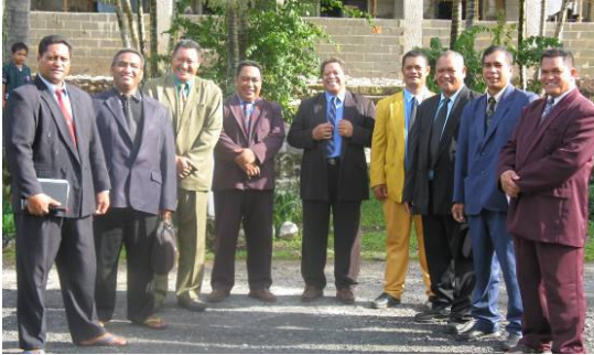
Te au papa apianga i Takamoa i teia mataiti 2009.

Kua tae takere mai tetai au patiangā i na te Puapii Maata ei, kare ra te kumiti i akara ake kia piri rava te tikaanga no te patiangā. I roto ia Tiurai/Aukute, kua akara ireira te kumiti ma te akatinamou i te au mapu no Takamoa. Ka tuku iatu te turanga no te au patiangā i roto ia Tepetema. Ko ratou tei manuia, ka anoanoia ratou ki Takamoa nei i te 3 o te epetoma o Tianuare 2010.