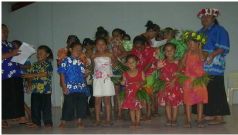
Tapere Tepauru e tana imene choir

Kua mataora tikai te au tuanga tei raveia mai e nga tapere e 3 i te reira po. I muri ake i te tuanga o te akaariarianga aitamu e pera te tuanga o te katikati, kua raveia ireira te tuanga o te pure. Kia akameitakiia te Atua koia i akatomo ia tatou ki roto i teia mataiti ou 2009. Te Atua te aroa no tatou katoatoa.