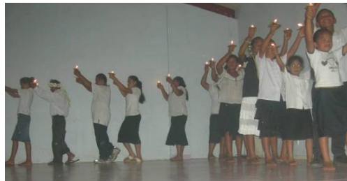
Ura akatangi (musical dance) tei akamouia ki runga i te pure a te Atua.