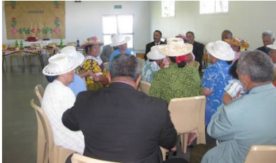
Te imene tamataora nei te Ekalesia i mua ake i te katikati.