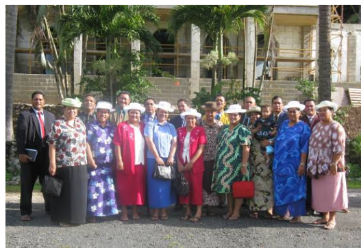
2009 Takamoa students and their wives.