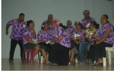
Tapere Kiriapi e tana imene tuki.