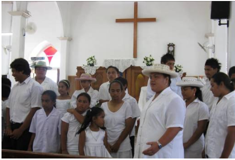
Ko tetai pae teia o te tamariki Apii Sabati o Avarua tei tere atu ki Ngatangia.

Ko te akateretereanga o te teretere Apii Sabati i Rarotonga nei, e raveia ana e 2 taime i te mataiti, i roto i te 3 o te epetoma o Me e Noema. Akamata i teia mataiti e tu mai nei, e manga tauiaanga tetai i te akanoonooanga o te teretere Apii Sabati. Kua ariiia teia tauiaanga e te Konitara Ekalesia Rarotonga i nga marama i topa.