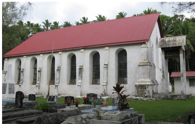
Above: the same building 117 years later. Notice the same number of windows and the 2 pillars on the front left and right corners. The first 2 photos were taken/reproduced from original photos provided by the Assistant Minister for Oneroa.