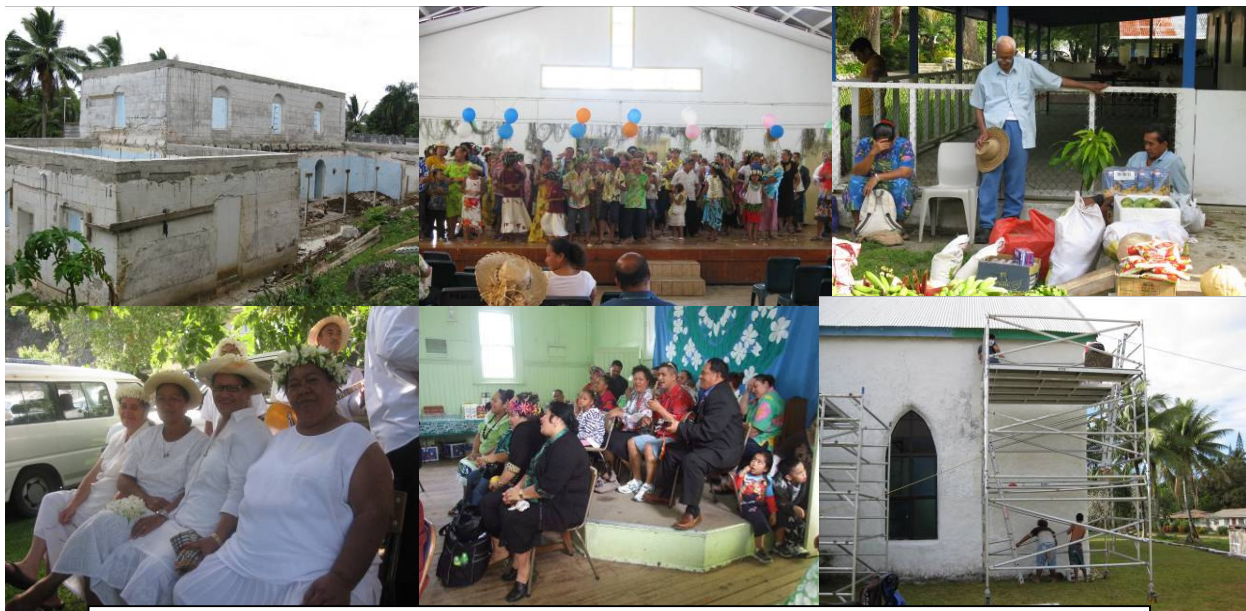
Clock-wise from top: new CICC office at Takamoa under renovation, Nikao Sunday School rally, Ngatangia Ekalesia food donations to Takamoa, some of the Mavera CICC vainerini at the 2008 Nuku at Takamoa, Clayton stringband with an old favourite from the 1960s in Melbourne, Oiretumu church in Mauke being renovated.