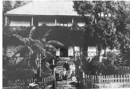
Mission House, Takamoa, 1897 (refer newsletter no.18)

I muri ake i te pure openga, kua aere atu te tangata i te tutaka ia roto i te ngutuare i mua ake ka vavai ia'i, e kua akaoti te au angaanga katoatoa na roto i te katikati.