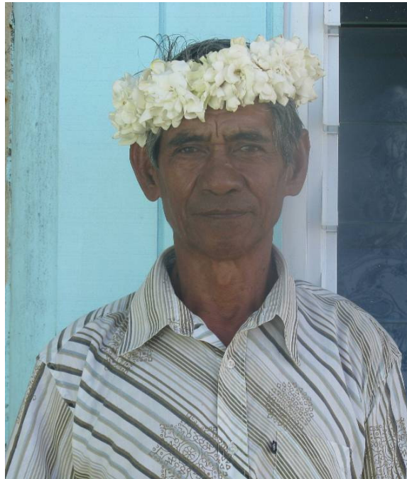
Ko Papa Matai Rongo teia o Aitutaki (Neneia e Tekura Potoru, Aitutaki, October 2008)