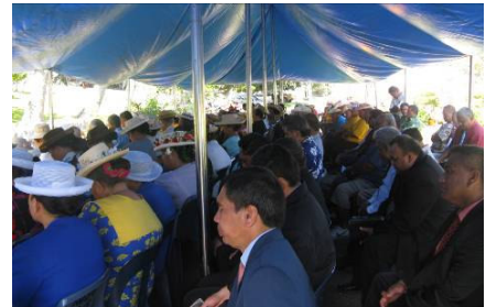
Service before renovation commences