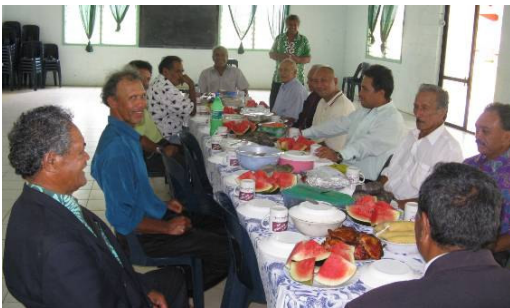
Katikati i mua ake i te uipaanga a te Konitara Ekalesia o Mangaia.