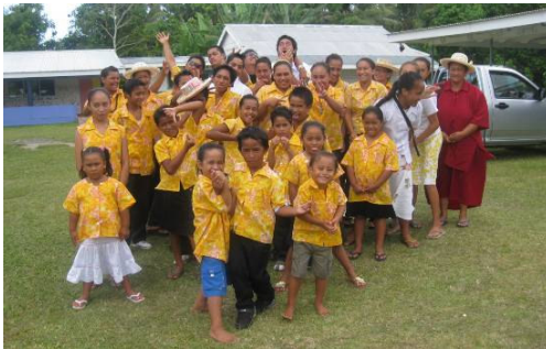
E mea mataora na te tamariki i te aru teretere. Ko te pupu teia tei tere atu mei Matavera ki Titikaveka.