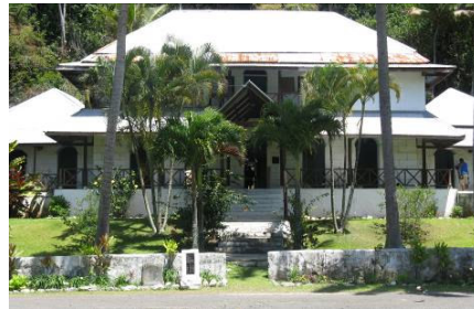
Mission House, 2008