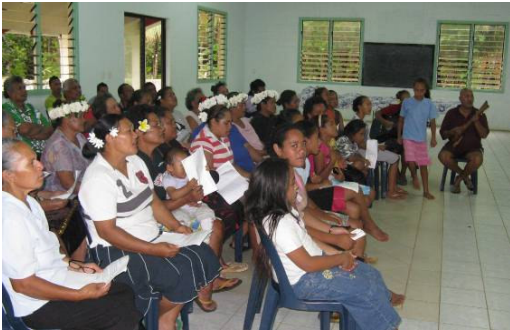
Te akateateamamao nei te mapu no ta ratou rally openga no teia mataiti 2008.