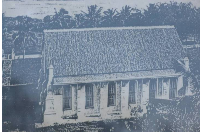
Above: barely legible footnote at bottom of photo (not included in above reproduced version) says this photo was taken in 1891. Below: replacing the roof, date unknown, thought to be in the 1970s.