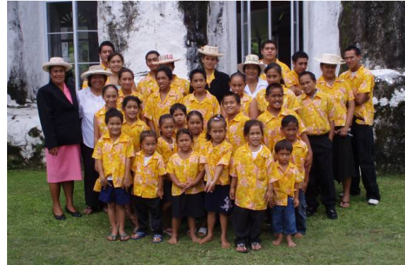
Ko te pupu teia o te Matavera Apii Sabati tei noo mai. E pupu ke tei aere atu ki Nikao. Kua pera ake, pera ake i roto i nga Ekalesia i Rarotonga nei.

teia e riro ana ei mataoraanga no te au tamariki i te aru teretere ma te vaa anga i te tuatua ora a to tatou Atua. E tuatau katoa no te au metua i roto i nga Ekalesia i te aravei ma te utuutu atu anga i te au taeake ma te anau te ka aru mai i te tere, kare atu e akakoroanga ke mari ra no te akamatutuanga i te anau tamariki kia tukatau ki roto i te Evangelia ei meitaki rai no ratou i te oraanga nei e to muri ake.