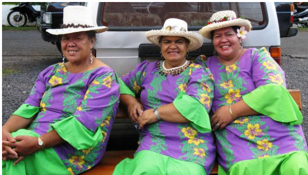
Tetai nga mama o Avarua

Ko tetai ra mataora teia no te au mama e pera te au papa, i te akaarianga i to ratou kakau akaau viravira e te sumaringa ki te katoatoa. Topiri atu ki te karere o te reira ra, e akakite katoaanga te rakei tei akonoia, i te akameitakianga a te Atua ki te tangata tana i anga. Ko te akakoroanga oki ia o te tuatua ora tana i vaio mai kia tatou, kia akamaneaia to tatou au kopapa ki te au rakei tei tau no te au akakoroanga e manganui, e pera te rakei anga ia tatou ki te kakau o te vaerua mei ta te tata Ebera i akataka mai. I tei akarongo iatu mei te au taeake o nga Ekalesia, kua mataora pu ua te katoatoa, kua ki te kopu i te kai o te vaerua e pera to te kopapa i te akaotianga o te au angaanga katotoa, kia akameitakiia te Atua no te au mea ravarai.