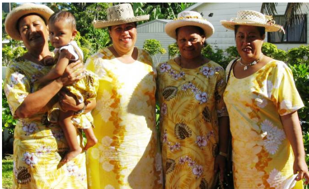
Tetai nga mama o Matavera