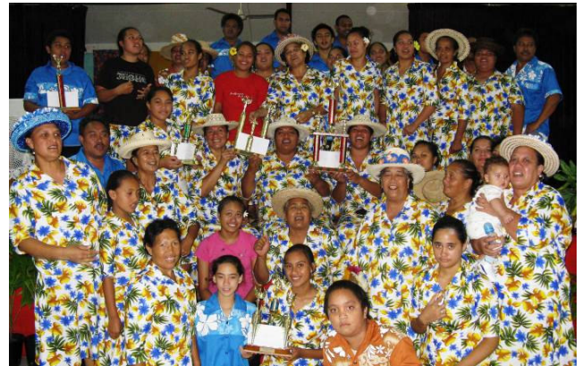
Overall winner, Avatiu CICC Youth

Kua peke te re maata i te Avatiu CICC Youth. Kua mataora e kua kitea te vaerua ora i roto i te au tapere. Kua raveia te akarakaraanga (evaluation) o teia porokaramu, e kua tuku te kaveinga no teia mataiti ki mua, no te akamaata i teia epetoma o te mapu i roto i te Ekalesia Avarua.