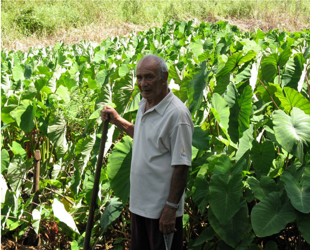
Ko Papa Ta teia i roto i tana pai taro i te pae i tona ngutuare i Matavera