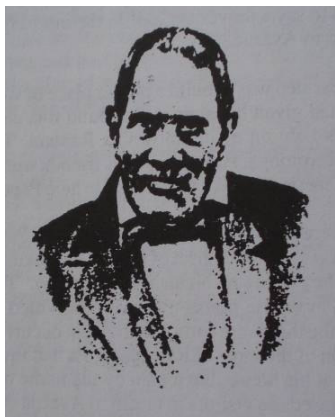
Papehia , the Raiatean Missionary from Tahiti who brought idolatry on Rarotonga to an end. He arrived with Rev. John Williams in 1823.