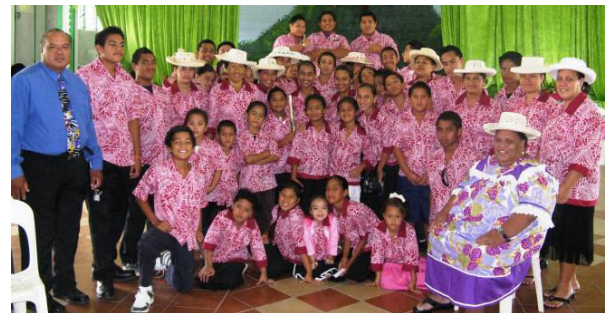
Ko te pupu teia o te Avarua Apii Sabati tei aere atu ki Arorangi.